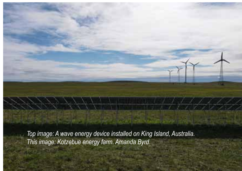
Top image: A wave energy device installed on King Island, Australia. This image: Kotzebue energy farm. Amanda Byrd.