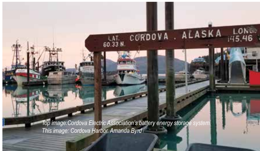
Top image: Cordova Electric Association's battery energy storage system. This image: Cordova Harbor.